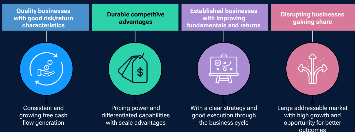
Fig 1: Concentrated Global Equity Strategy – Stock Selection Is Focused on Identifying Strong Businesses