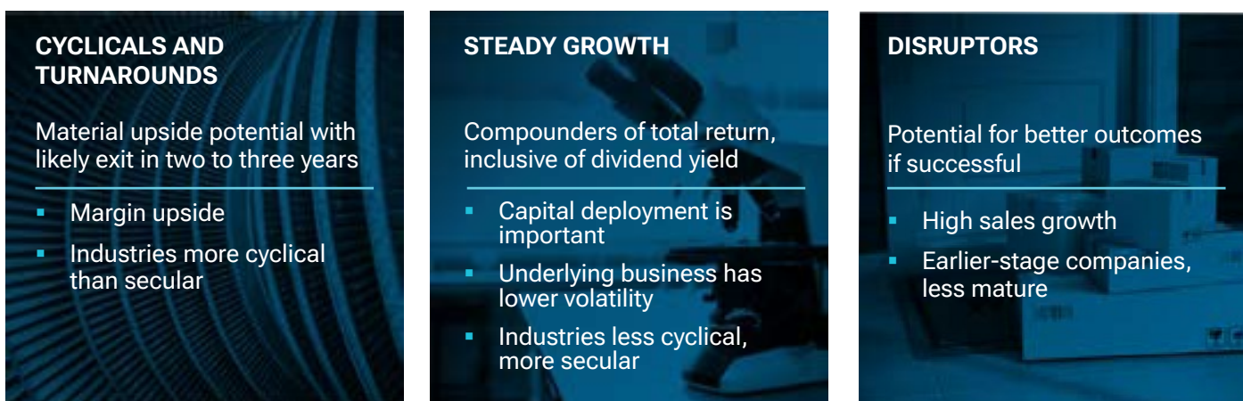
Fig. 2: Style-Balanced Approach Enables Opportunities To Add Value In All Market Environments

The portfolio seeks to have meaningful exposure to steady growth but could be overweight disruptors or cyclical turnarounds at times depending on market opportunities. Constructing a style-balanced portfolio is how we believe we will be able to add value for clients over the long term, regardless of the market environment.