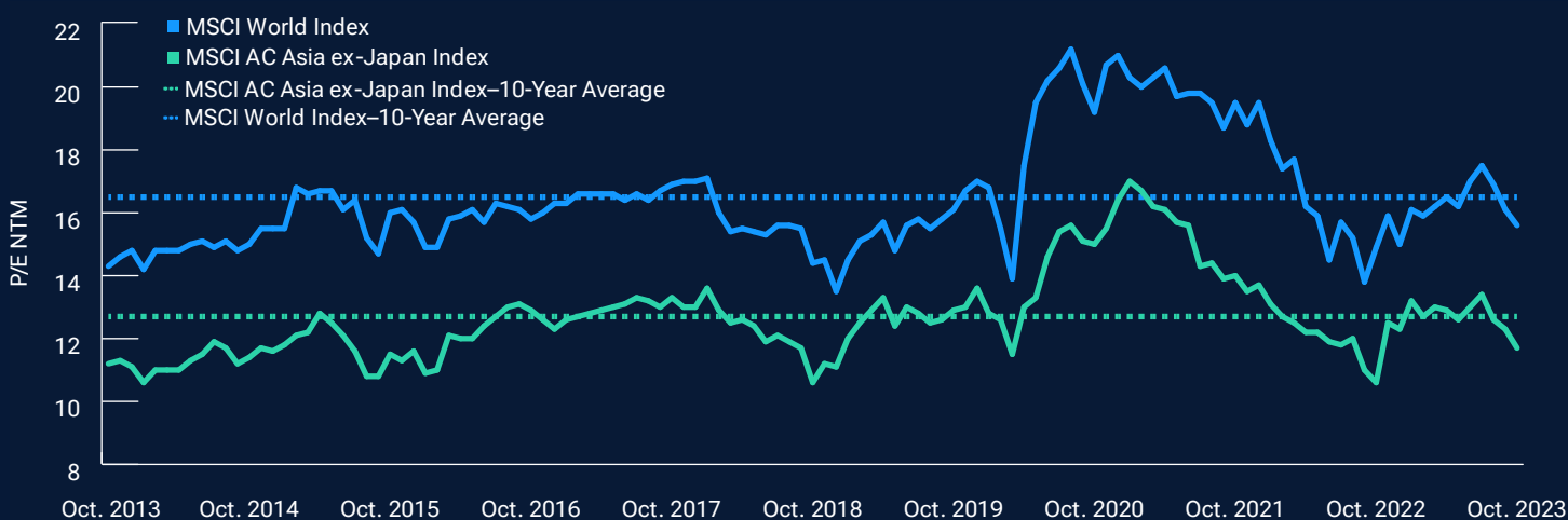
(Fig. 1) Next 12-month (NTM) price-to-earnings (P/E) ratios in Asia ex-Japan and the world