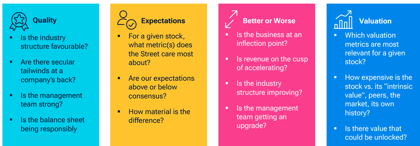
Fig. 2: Our 4-pillars investment framework

Ultimately, we believe that companies with sustainable and durable earnings, revenue, and cash flow growth drive shareholder value.