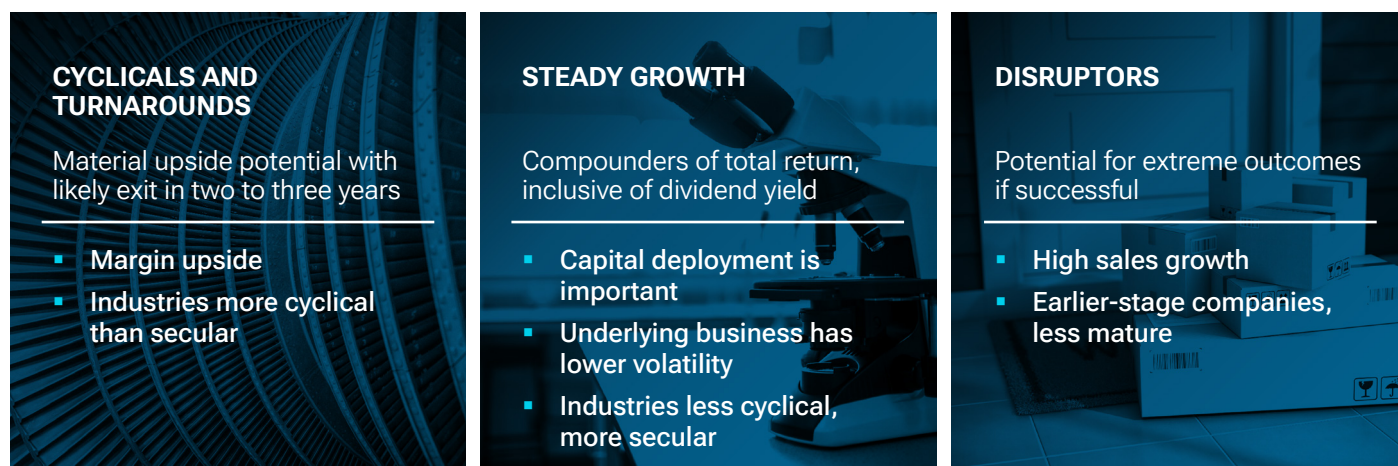
Fig. 2: Style-Balanced Approach Enables Opportunities To Add Value In All Market Environments

The portfolio seeks to have meaningful exposure to steady growth but could be overweight disruptors or cyclical turnarounds at times depending on market opportunities. Constructing a style-balanced portfolio is how we believe we will be able to add value for clients over the long term, regardless of the market environment.