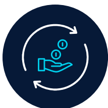
Fig. 1: Global Select Equity Fund – Stock Selection Is Focused on Identifying Strong Businesses

Quality businesses with good risk/return characteristics