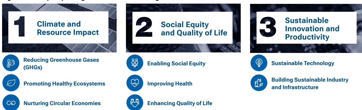
Fig. 3: Three impact pillars guide our decision-making

To ensure the sustainability of returns, we seek debt issuers that possess a long-term competitive advantage from a capital market, competitive and economic returns perspective.